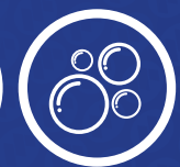
HYGIENE & CLEANING

Manufactured in the UK to the most stringent OEM and international standards.