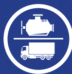
HEAVY DUTY DIESEL ENGINE OILS